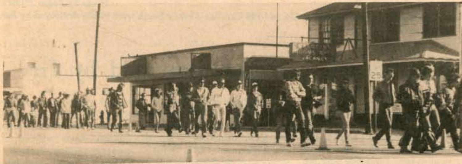
Hundreds of spectators gathered to watch the cars race through the 1/2 mile course.

Special Thanks Given to Volunteers: With the arrival of the Thanksgiving Season, the Cape Fear Council, Boy Scouts of America, wishes to extend a special expression of appreciation to the volunteers who make Scouting come alive for the youth in Southeastern North Carolina.