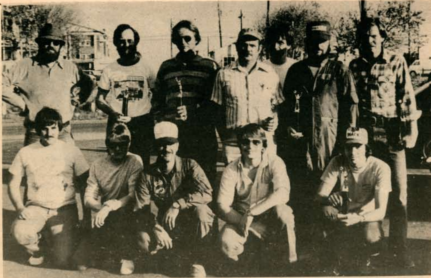
Pictured above some of the winners of Carolina Beach's first Auto-Cross.