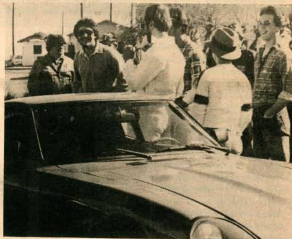
Club members showed off their trophy winning cars after the race.