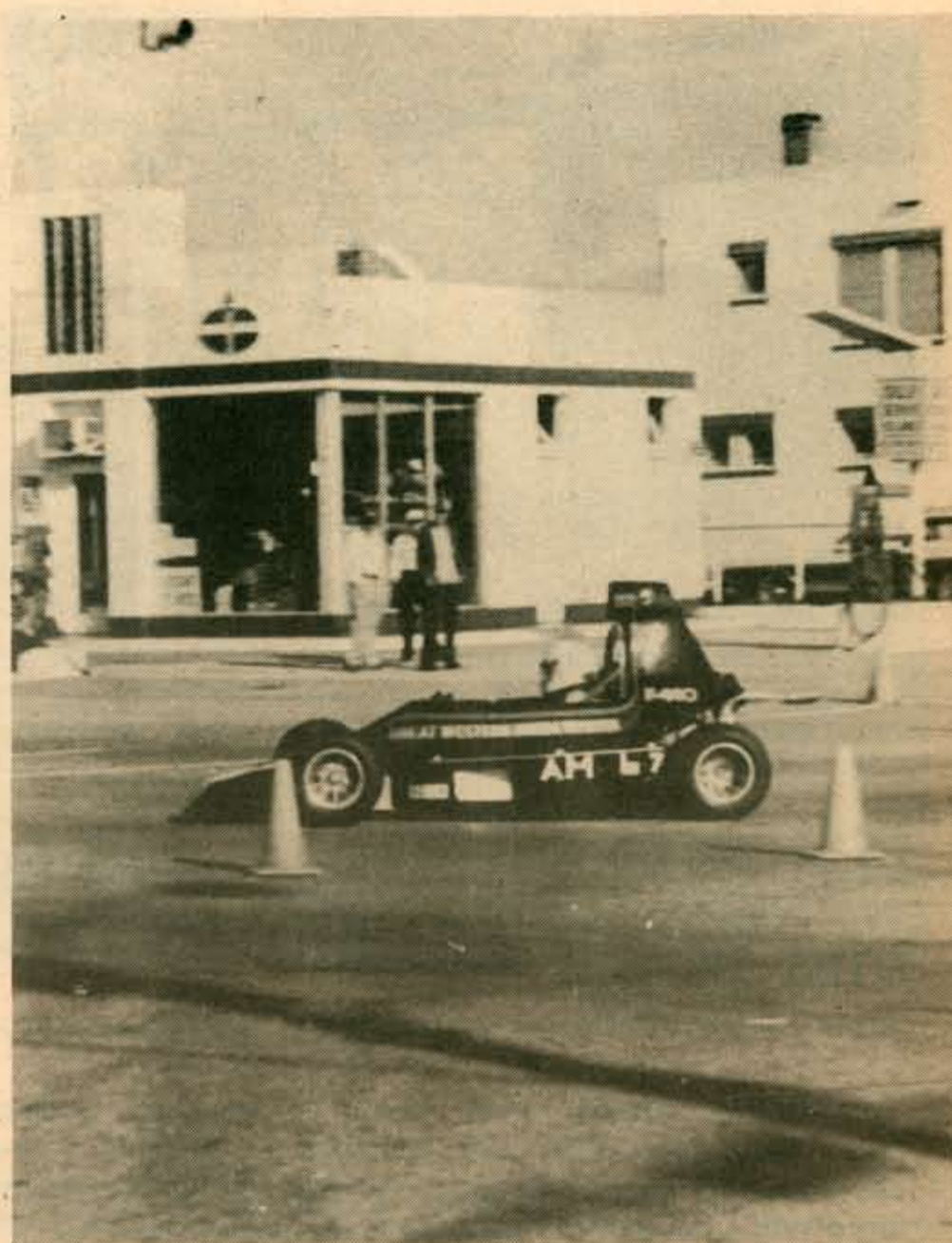
Thirteen different classes of sports cars participated in the event.